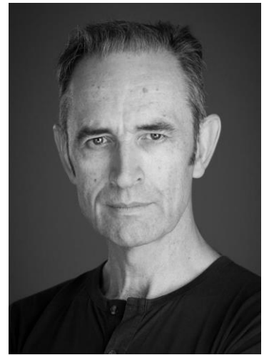
Terence Crawford - O'Brien